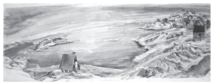
"Upernavik Panorama #2"

with bold, swift strokes breezily evoking mounds of snow and ice gliding over water like mountains taking flight. And a dynamic vertiginousness, akin to some of Wayne Thiebaud's odd twists on landscape perspective, enlivens other compositions, such as "Upernavik Panorama #2," an oil on canvas depicting an overcast day in northwest Greenland. In this work, the "ends of the earth" feeling is enhanced by the way the horizon-line slants, suggesting the actual curve of the globe.