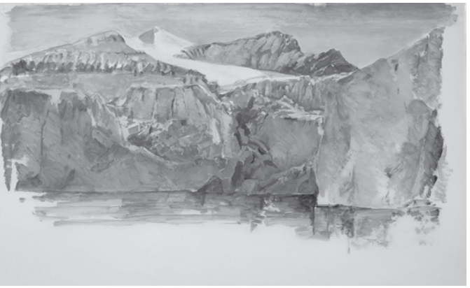
"Svalbard Glacier #2"

Relatively new to Clark's oeuvre are a series of collages and photo collages, such as "Pouch Cove #2, 2005," in which an oil sketch on Denril (a material similar to Mylar, but lighter) of a landscape dotted with small white houses is superimposed over a map of Newfoundland, with the Gulf of St. Lawrence serving as the pale blue sky and the cream-colored islands morphing into clouds rising up from behind the verdant painted hills. In contrast to the wild